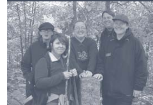
We made it to the Top!

PO BOX 51003, BOSTON, MA 02205 617-247-4927 info@ecclesia-ministries.org www.ecclesia-ministries.org