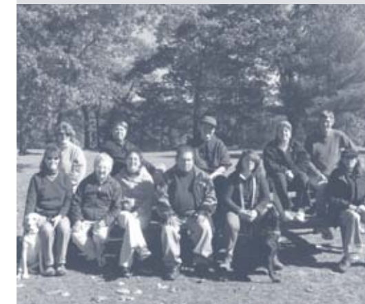
A glorious fall day for our 2nd Annual Blue Hills Fundraising Hike in October.